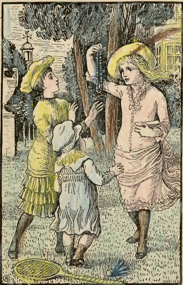
“DID YOU EVER SEE ANYTHING SO PRETTY, BEE?” ROSY REPEATED.—Page 120.